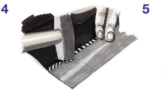
Bend down the seam whilst ensuring that the cloth remains fastened

Make a cut at the edge of the lifted seam section