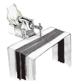
Spotweld the steel and form to the desired shape

Information contained herein is based on careful tests and experience. It reflects our knowledge and is for guidance purpose only. It is given in good faith and user should ensure that the product is fit for purpose before any application. The quoted values are average and should not be taken as maximum or minimum values for specific purposes. Manufacturer and distributor are not responsible for any non-recommended use or consequential damage.