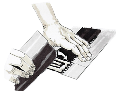
Coat the cloth with the appropriate adhesive or use our self-adhesive pads (if appropriate). Join both sides and press together firmly