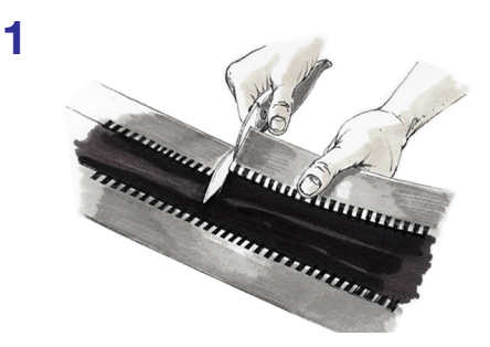
At a notch, cut a length equivalent to the perimeter required plus an overlap of 5 to 6 cm (2") for joining