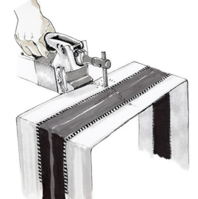
Spotweld the steel and form to the desired shape

Coat the cloth with the appropriate adhesive or use our self-adhesive pads (if appropriate). Join both sides and press together firmly