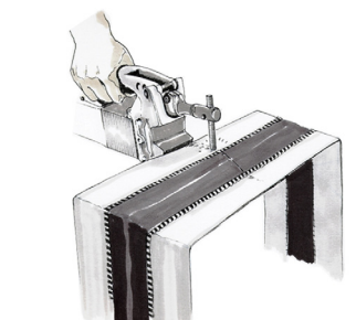
Spotweld the steel and form to the desired shape

Coat the cloth with the appropriate adhesive or use our self-adhesive pads (if appropriate). Join both sides and press together firmly