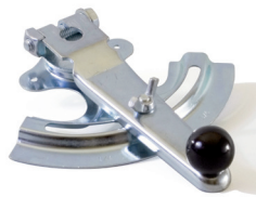
RG-175-K (shaft 1/2") RG-185-K (shaft 12mm) Ball drive on handle end