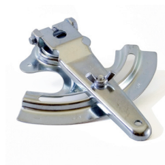
RG-75 (shaft 1/2") RG-85 (shaft 12mm) Simple and economical