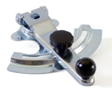
RG-375-K-S (shaft 1/2") RG-385-K-S (shaft 12mm) Ball drive on handle & star shaped locking nut