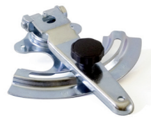
RG-275-S (shaft 1/2") RG-285-S (shaft 12mm) Star shaped locking nut